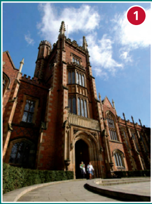
The Lanyon Building