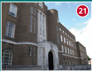
The David Keir Building