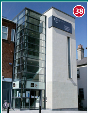
The Student Guidance Centre