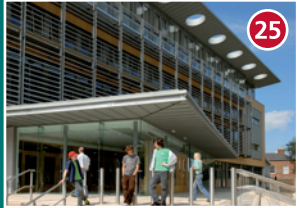
The Students' Union