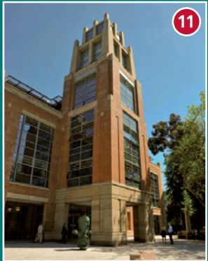
The Library at Queen's